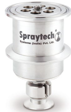
2" TC (DIN32676-A DN50)